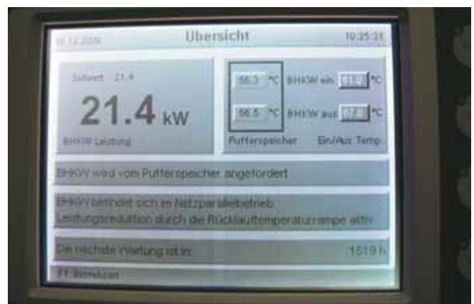
Settings on the operating and display unit of the CHP unit