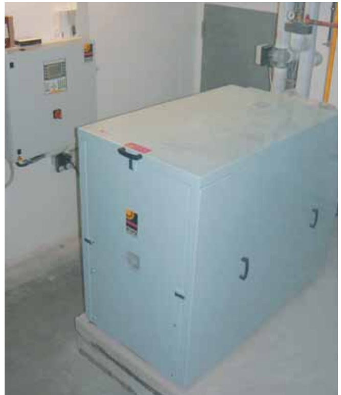
30 kW natural-gas-powered CHP unit in the heating cellar