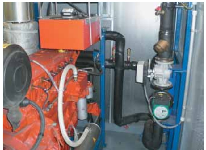
A view into the interior of the soundproof container