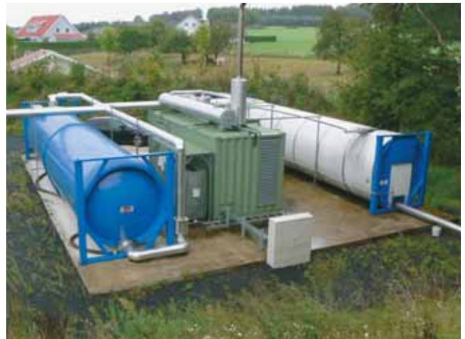
340 kW vegetable-oil-powered CHP unit with a 50 m 3 buffer tank and a 50 m 3 fuel tank