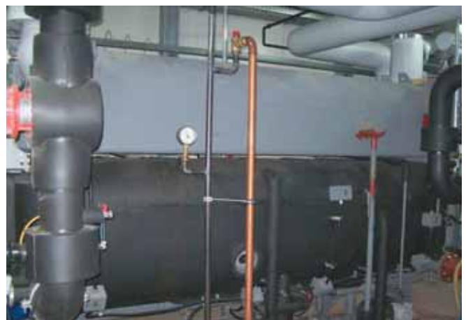
Absorption cooler with approximately 220 kW of cooling capability