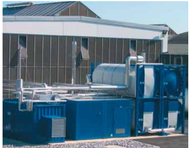
120 kW vegetable-oil-powered CHP unit, heating control centre, fuel tank and buffer tank