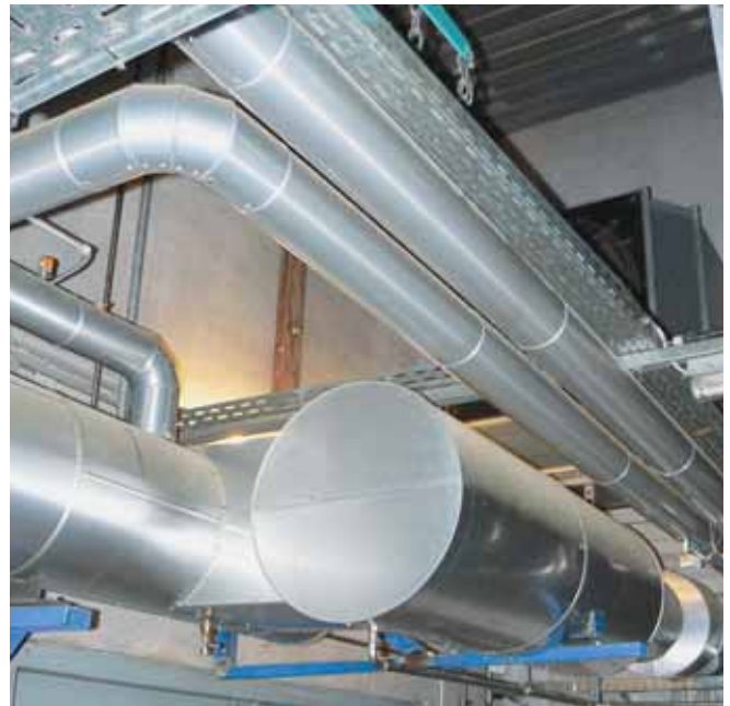
Exhaust gas routing system in the heating building