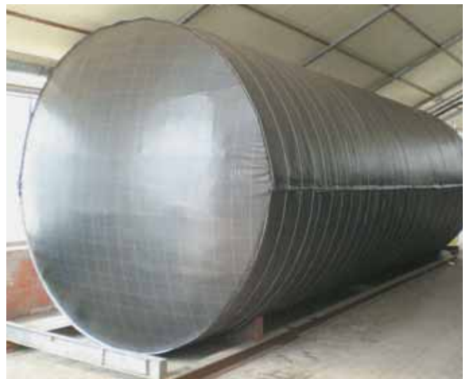
Fuel tank with a 60 m 3 capacity