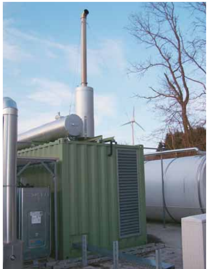
Rear view of the CHP unit