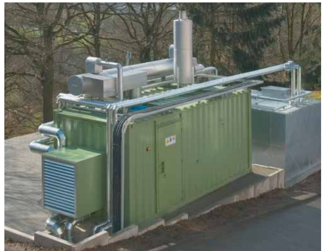
Linking to the paint plant