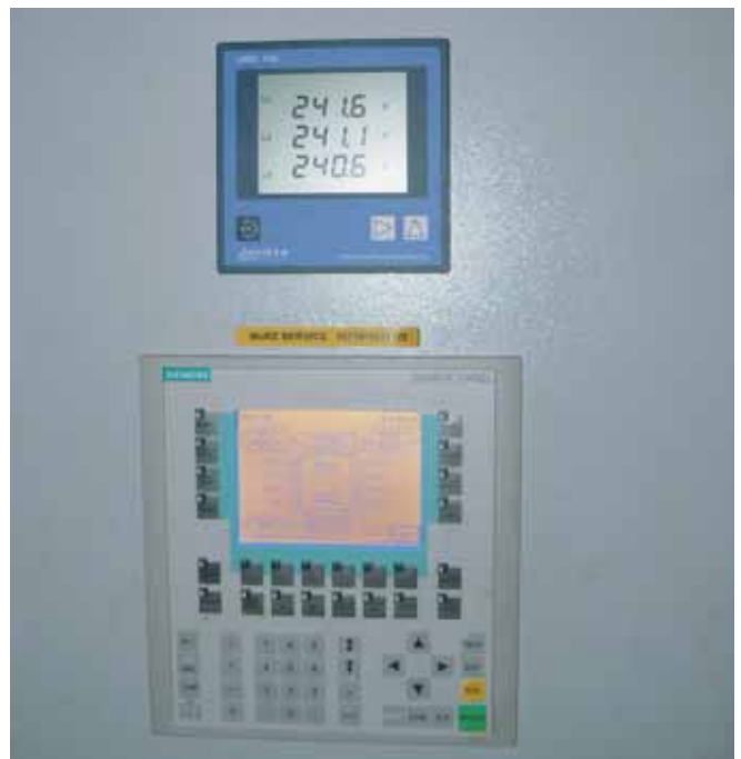
Operating and display unit on the enclosure of the CHP unit