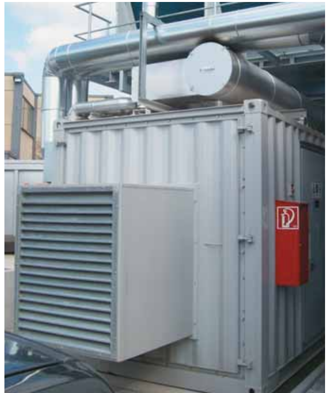
RPS-340 CHP unit in a container with re-cooling equipment on the roof