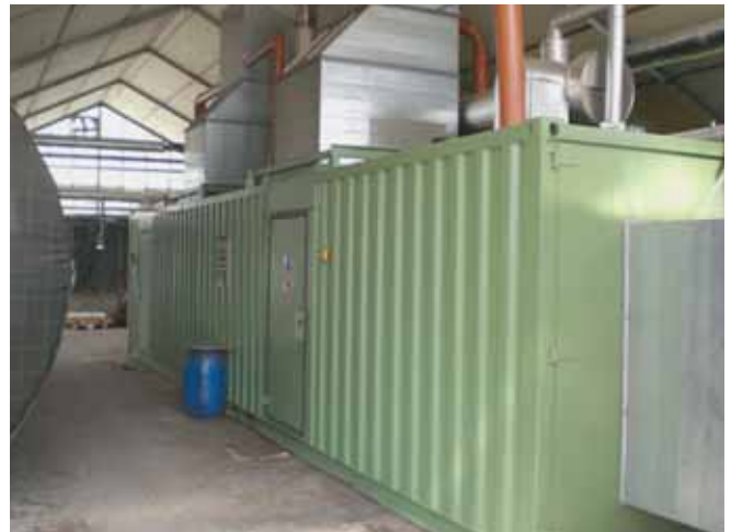
Dual installation with 2 CHP units each with 340 kW in a common container