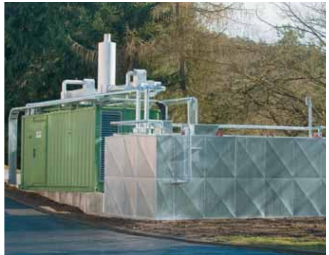
RPS-340 CHP unit with 36 m³ large vegetable oil storage tank